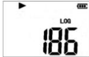
② Log interface (record state)