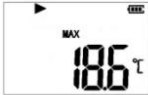
③ Temperature max interface (record state) ④ Temperature minimum interface (record state)