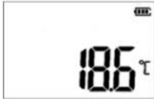
① Real time temperature interface (initialization state)

Real time temperature interface → Data number interface → Temperature maximum interface → Temperature minimum interface.