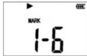
④ Mark number interface (record state)