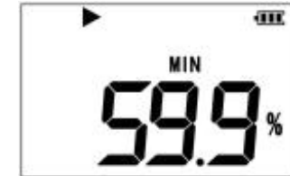
⑧ Humidity minimum interface (record state)