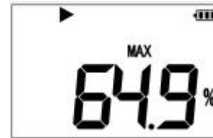
⑦ Humidity max interface (record state)