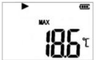
⑤ Temperature max interface (record state)