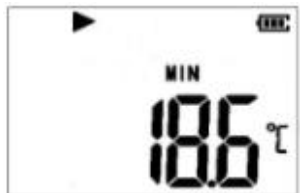
⑥ Temperature minimum interface (record state)