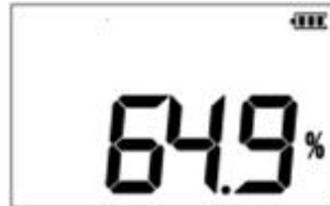
② Real time humidity interface (initialization state)