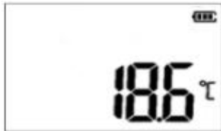
① Real time temperature interface (initialization state)

1) Short press the start button to switch the display interface in turn Real time temperature interface → Real time humidity interface → Log interface → Mark number interface → Temperature maximum interface → Temperature minimum interface → Humidity maximum interface → Humidity minimum interface.